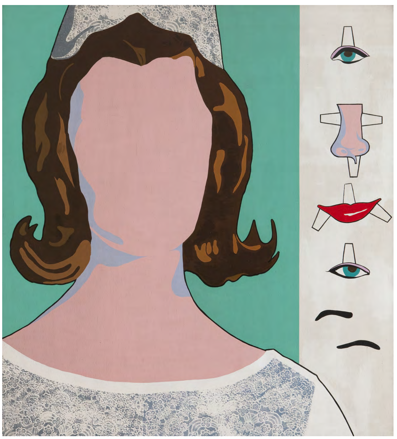
Allan D'Arcangelo, The Bride, 1962, Acrylic on canvas, 60 x 54 inches