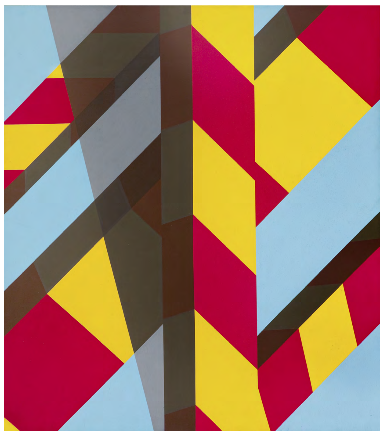
Allan D'Arcangelo, Landscape BB (74), 1968, Acrylic on canvas, 54 x 48 inches