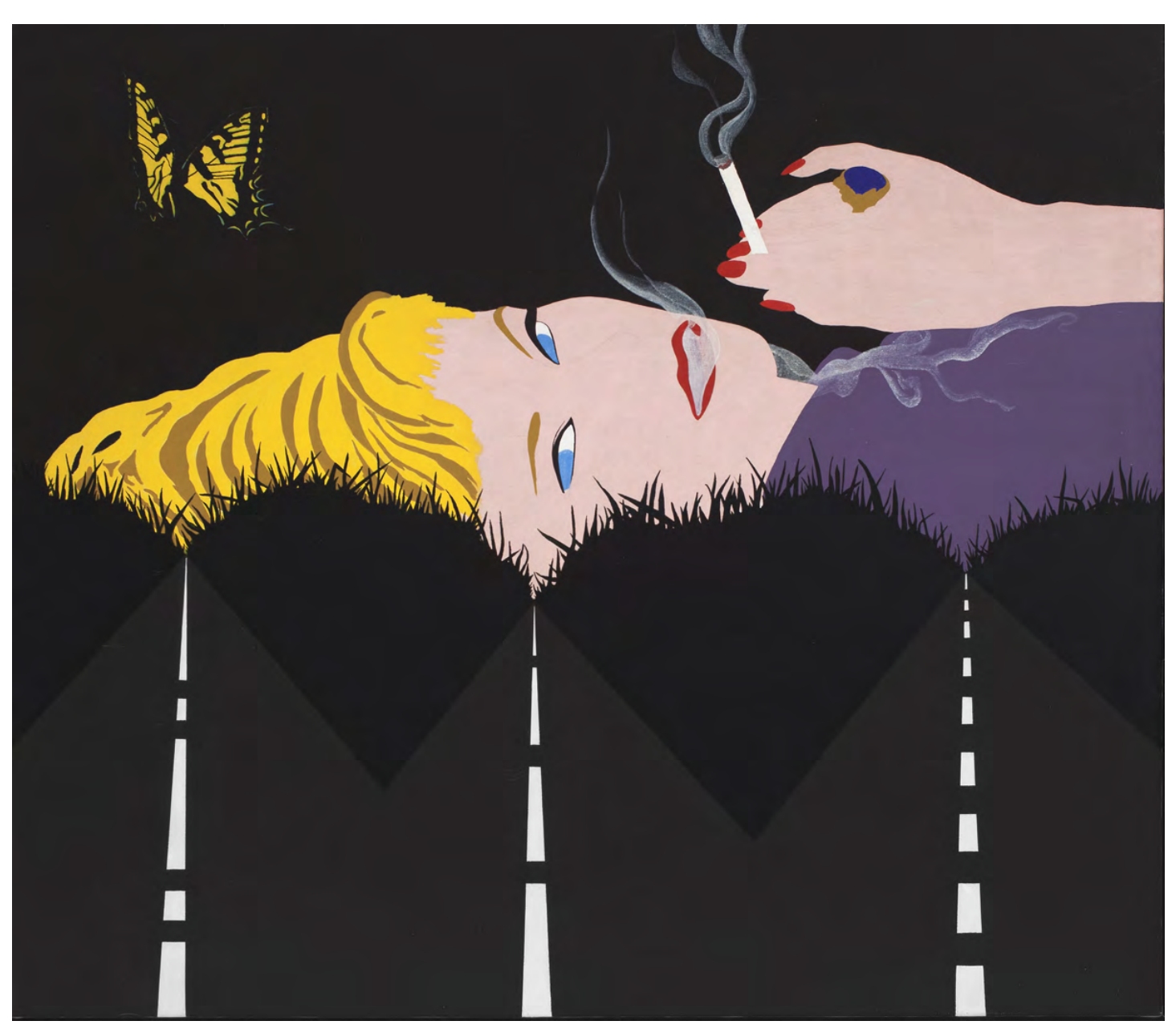
Allan D'Arcangelo, Smoke Dream #1, 1963, Acrylic on canvas, 44 x 511/2 inches