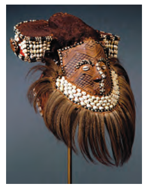
Museum; Robert B. Woodward Memorial Fund.

Kuba artist, mask (Mwaash aMbooy), late 19th or early 20th century, rawhide, paint, plant fibers, textile, cowrie shells. glass, wood, monkey pelt, and feathers, 22" x 20" x 18". Brooklyn