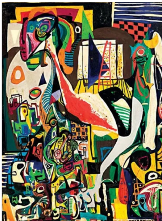
📷 Ruth Lewin, Untitled [Abstraction] , c.1940s, tempera, metallic paint, and gesso on panel. It is among the works on show at Gallery Hollis Taggart.

Lewin, a member of the Indian Space Painter movement, was influenced by Abstract Expressionism, the natural world and the iconography of the northwest coast indigenous peoples. She produced paintings, drawings and block prints, and is known for compositions that examine the effects of war. Her works are in the collections of the National Gallery of Art in Washington, DC and the Library of Congress.