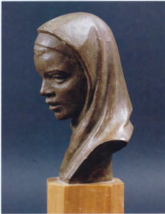
Richmond Barthé (1901-1989), Black Madonna, 1961. Painted terra cotta on original wood vase, 5½ x 3⅝ x 3⅜ in., signed at rear: 'Barthé'.