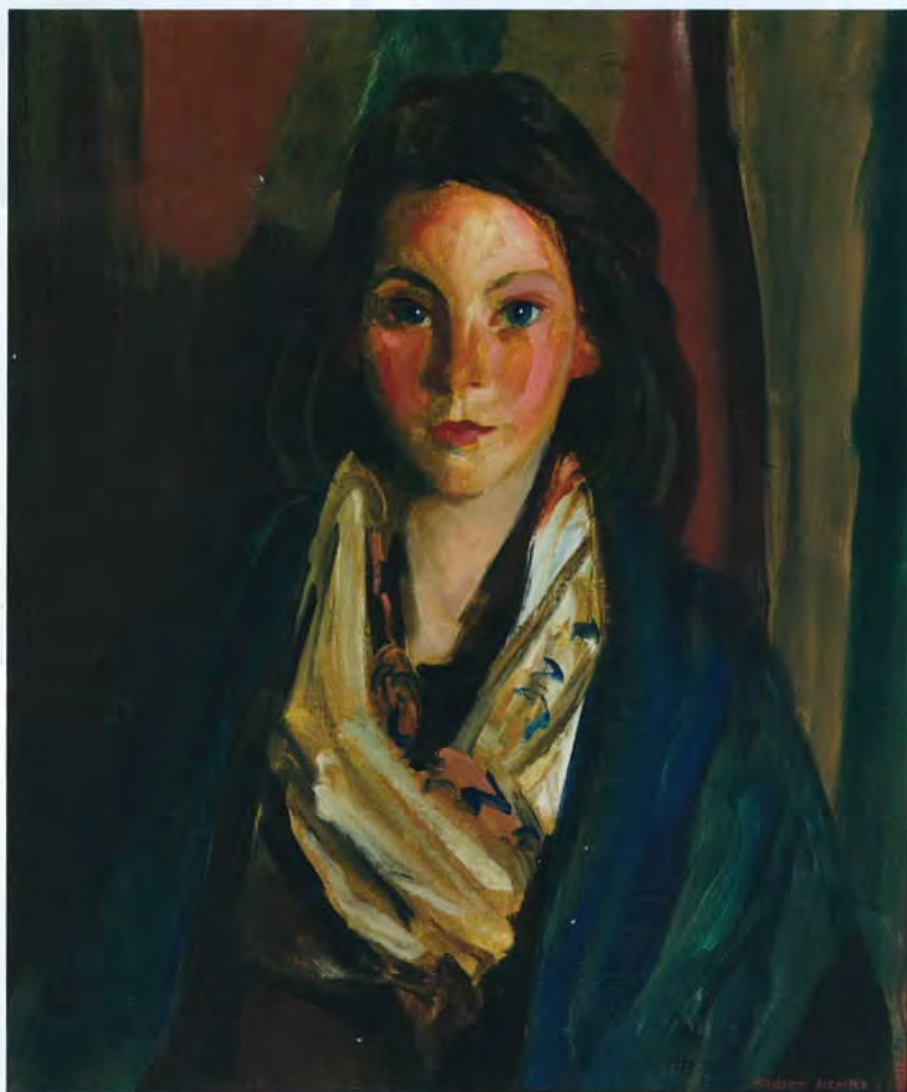
Robert Henri (1865-1929), Coleen, 1926. Oil on canvas, 23½ x 19¼ in.