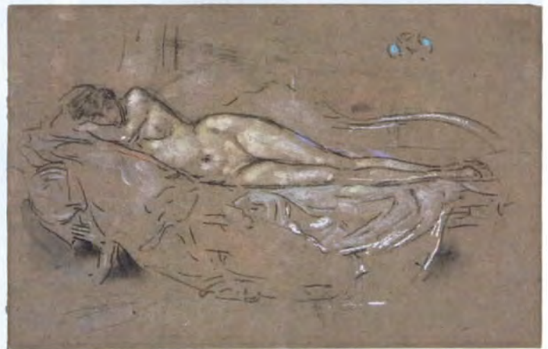
James Abbott McNeill Whistler (1834-1903), Nude Reclining, 1893-1900. Colored pastel and black chalk on brown wove paper laid down on card, 7 x 10⅞ in., artist's butterfly monogram in chalk upper right.