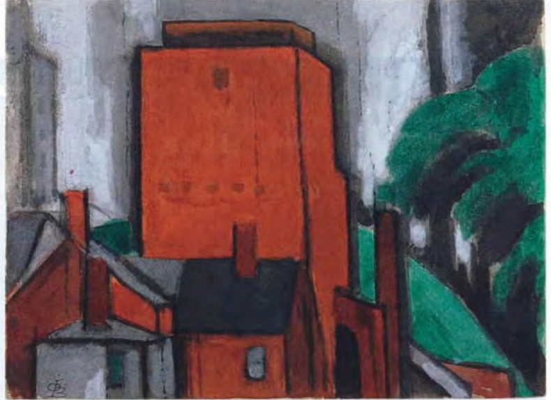
Oscar Bluemner (1867-1938), Fall River Theatre, 1922. Watercolor and gouache on paper, signed with monogrammed initials lower left: 'OFB'; dated 'Fall River Je 17-2' and inscribed with notation on verso.