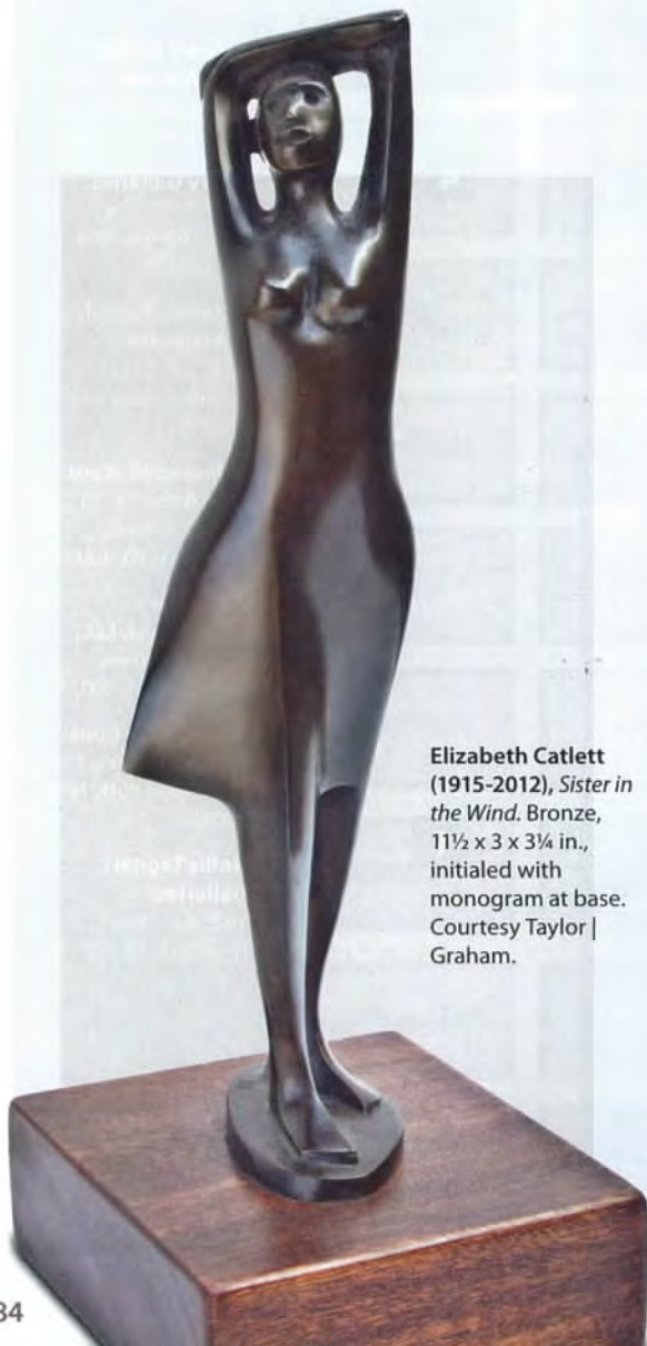
Elizabeth Catlett (1915-2012), Sister in the Wind. Bronze, 11½ x 3 x 3¼ in., initialed with monogram at base.