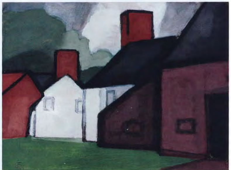
Oscar Bluemner (1867-1938), Untitled , ca. 1914-15. Watercolor on paper, 5 x 6¾ in. Courtesy Hollis Taggart Galleries.