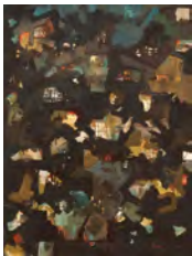
Audrey Flack (b. 1931) Black Graph , 1951 Signed and dated lower right: "Flack / 51" Oil on canvas 44 x 33 inches (111.8 x 83.8 cm)