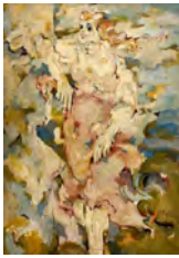
Audrey Flack (b. 1931) Waiting for Ulysses , 1952-3 Signed lower right: "A. Flack" Oil on canvas 52 x 36 inches (132.1 x 91.4 cm)