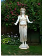
Audrey Flack (b. 1931) Susquehanna (cuwe-pahelle) , 1996 Painted fiberglass composite Overall height: 9 1/2 feet (2.8956 meters)