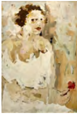
Audrey Flack (b. 1931) Lady with a Pink , 1952 Signed lower right: "A. Flack" Oil on canvas 49 x 33 inches (124.5 x 83.8 cm)