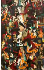
Audrey Flack (b. 1931) Flashback , 1949–50 Oil on canvas 44 1/2 x 27 3/4 inches (113 x 70.5 cm)

Hamptons Fine Art Fair 2021 Southampton Arts Center 2 - 5 September 2021 Booth 2