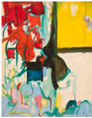
Audrey Flack (b. 1931) Daybreak , 1952–53 Signed lower left: "Audrey Flack" Gouache on paper 23 3/4 x 18 3/4 inches (60.3 x 47.6 cm)