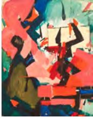
Audrey Flack (b. 1931) Abstract Force II , 1951–52 Signed lower right: "A. Flack" Gouache on paper 23 3/4 x 18 1/2 inches (60.3 x 47 cm)