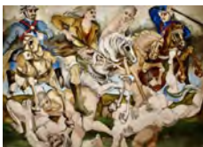
Audrey Flack (b. 1931) Horsemen of the Apocalypse , 1962 Signed lower right: "Audrey Flack" Oil on canvas