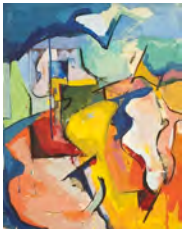
Audrey Flack (b. 1931) Passages , 1951 Signed lower right: "A. Flack" Gouache on paper 23 3/4 x 18 1/2 inches (60.3 x 47 cm)