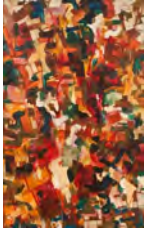
Audrey Flack (b. 1931) Abstract for Tomlin , circa 1950–51 Signed lower right: "Audrey Flack" Oil on canvas 44 3/4 x 27 1/2 inches (113.7 x 69.8 cm)

Hollis Taggart is pleased to announce that the Hamptons Fine Art Fair is honoring Audrey Flack with a lifetime achievement award and a solo booth presentation.