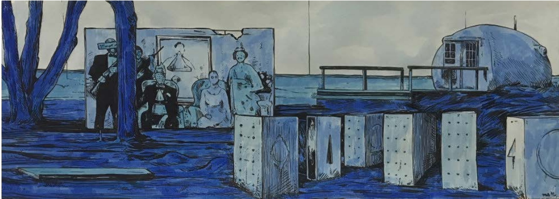
William Buchina (b. 1978) Scenery in Blue #13 , 2021 Ink on paper 8 x 22 inches (20.3 x 55.9 cm)