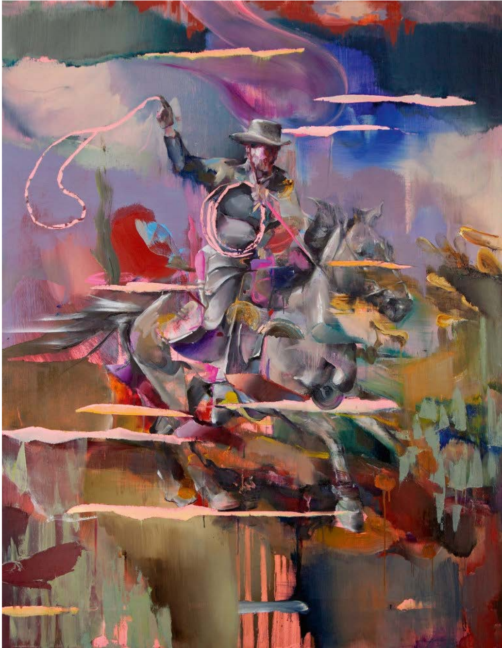
Justine Otto (b. 1974) Lasso Thrower , 2018 Oil on linen 70 x 55 in (177.8 x 139.7 cm)