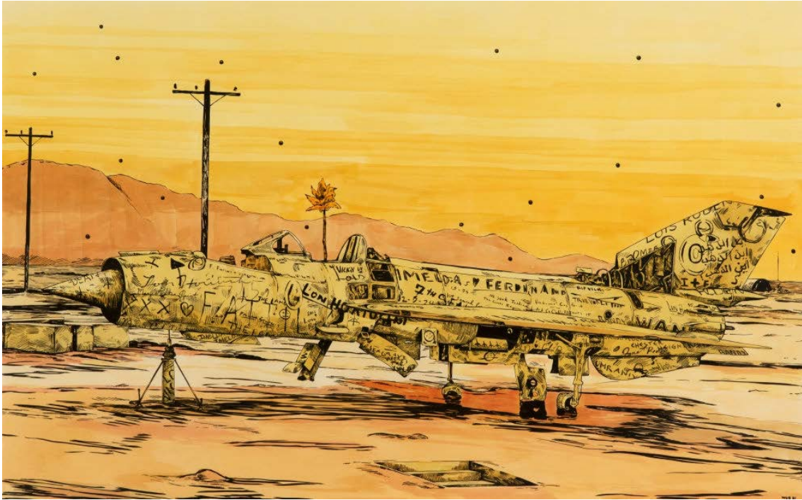
William Buchina (b. 1978) Three Thousand Shoes #4, 2021 Ink on paper 40 x 25 in (101.6 x 114.3 cm)