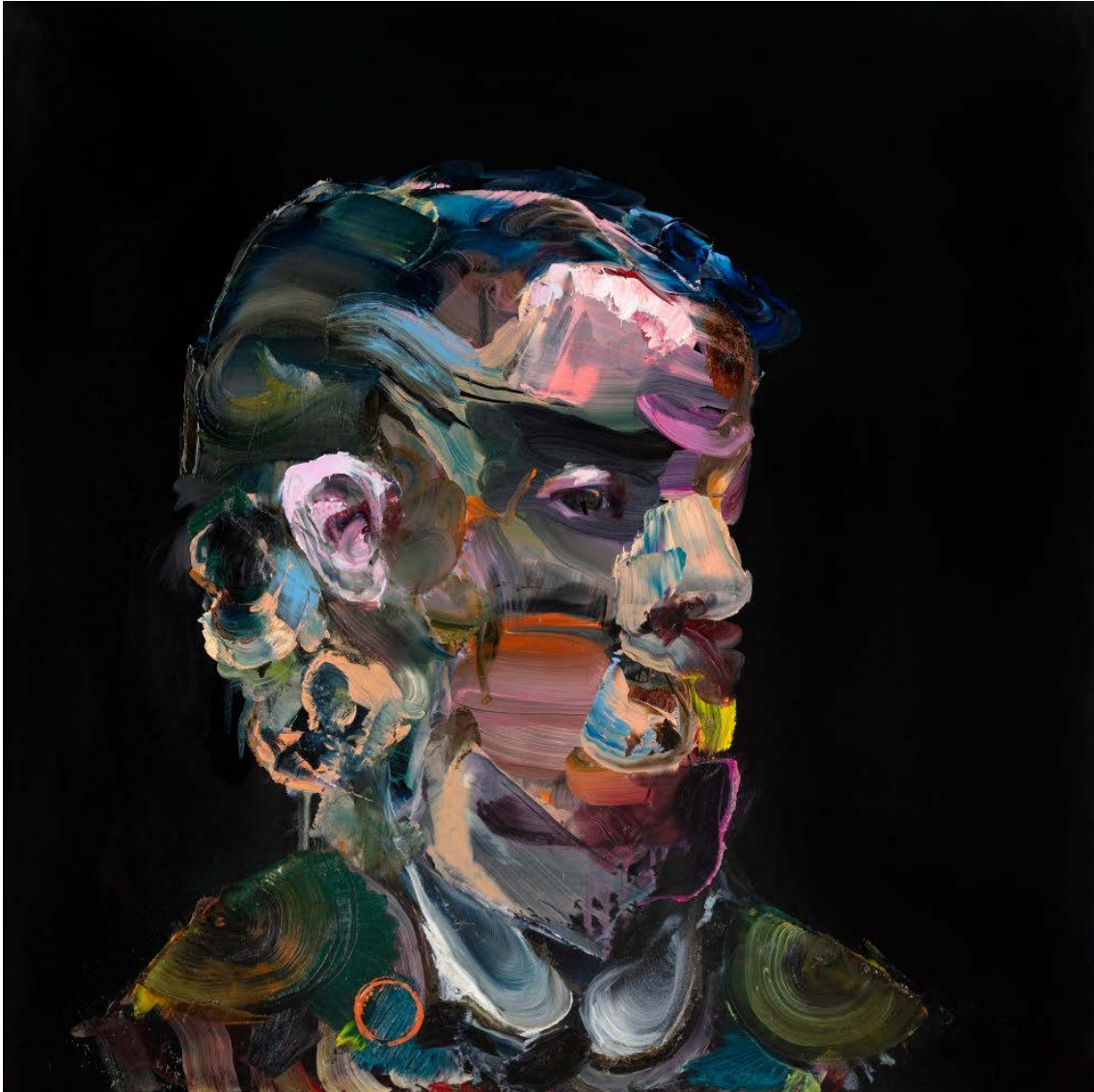
Justine Otto (b. 1974) Kjell , 2021 Oil on MDF 21 1/2 x 21 1/2 in (54.6 x 54.6 cm)