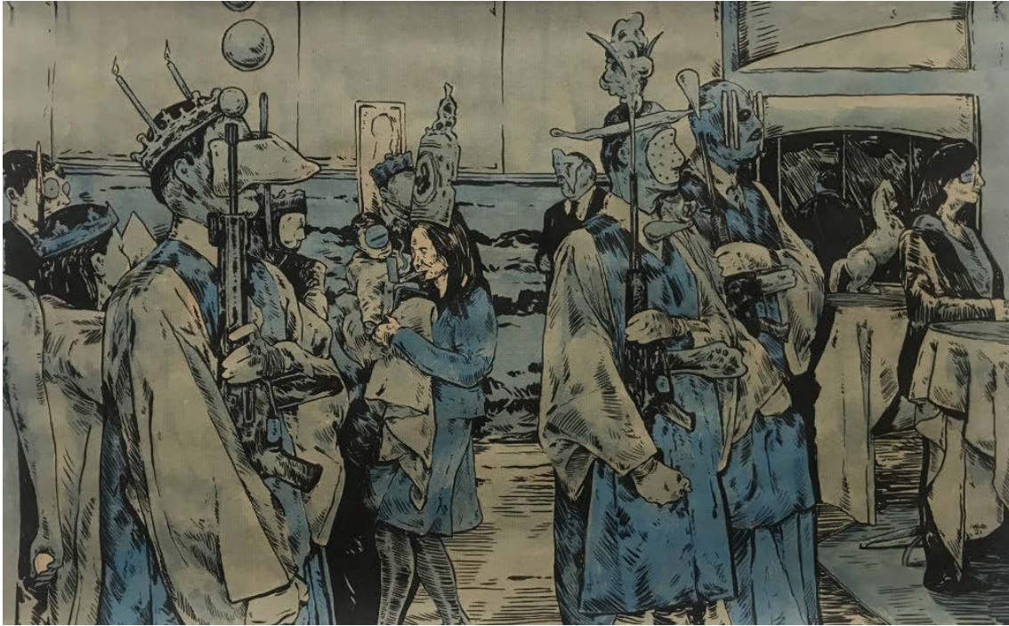
William Buchina (b. 1978) Scenery in Blue #15, 2021 Ink on paper 12 x 19 inches (30.5 x 48.3 cm)