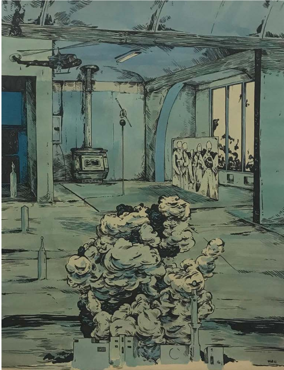
William Buchina (b. 1978) Scenery in Blue #14 , 2021 Ink on paper 22 x 17 inches (55.9 x 43.2 cm)