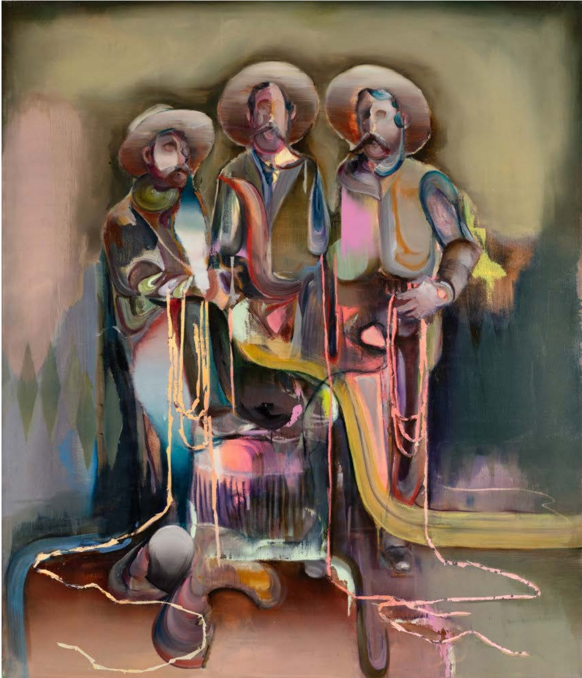
Justine Otto (b. 1974) Gang Bang , 2019 Oil on linen 55 x 47 in (139.7 x 119.4 cm)