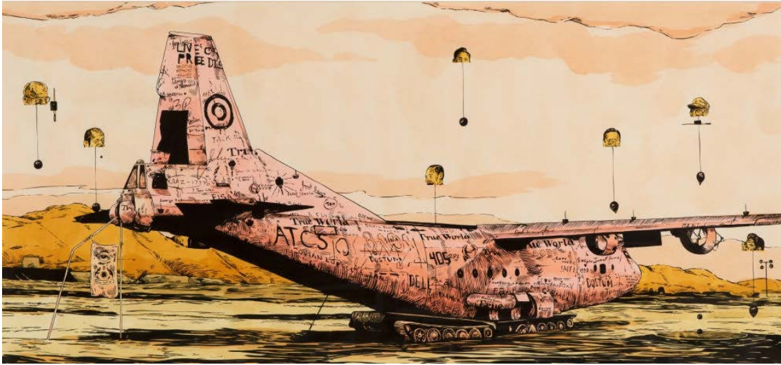
William Buchina (b. 1978) Three Thousand Shoes #3, 2021 Ink on paper 20 x 43 in (101.6 x 114.3 cm)