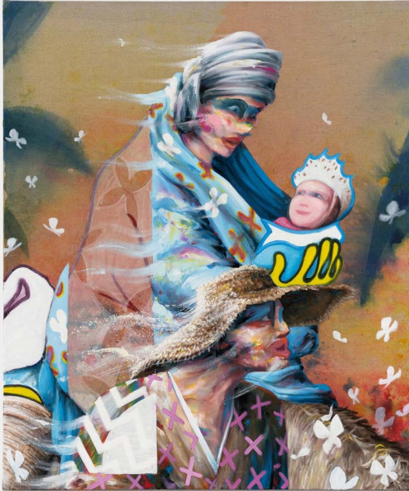
Thomas Agrinier (b. 1976) The Flight Into Egypt (after Rembrandt) , 2022 Ink and oil on canvas 43 1/4 x 36 1/4 in (110 x 92 cm) SOLD