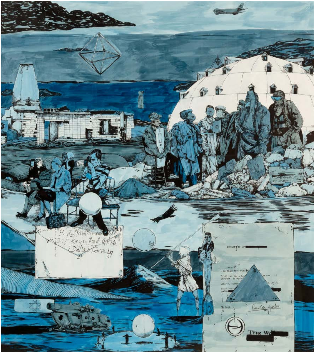
William Buchina (b. 1978) Three Thousand Shoes #2, 2021 Ink on paper 45 x 40 in (114.3 x 101.6 cm)