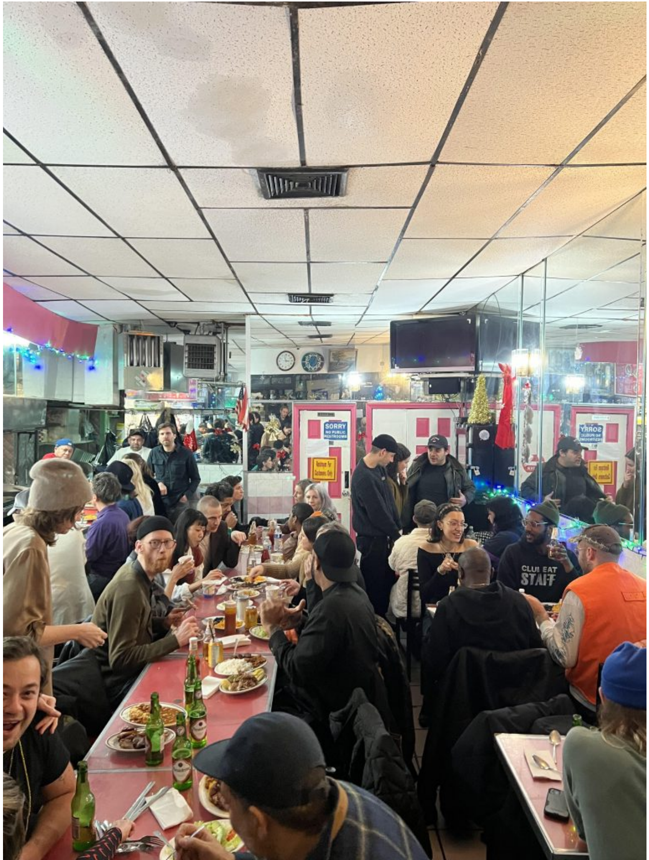
The scene at Westside Coffee Shop.