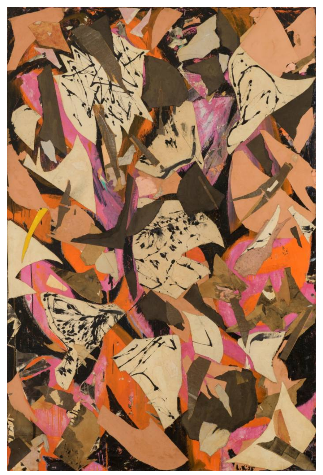
Lee Krasner, 'Bald Eagle' (1955) © Pollock-Krasner Foundation/DACS