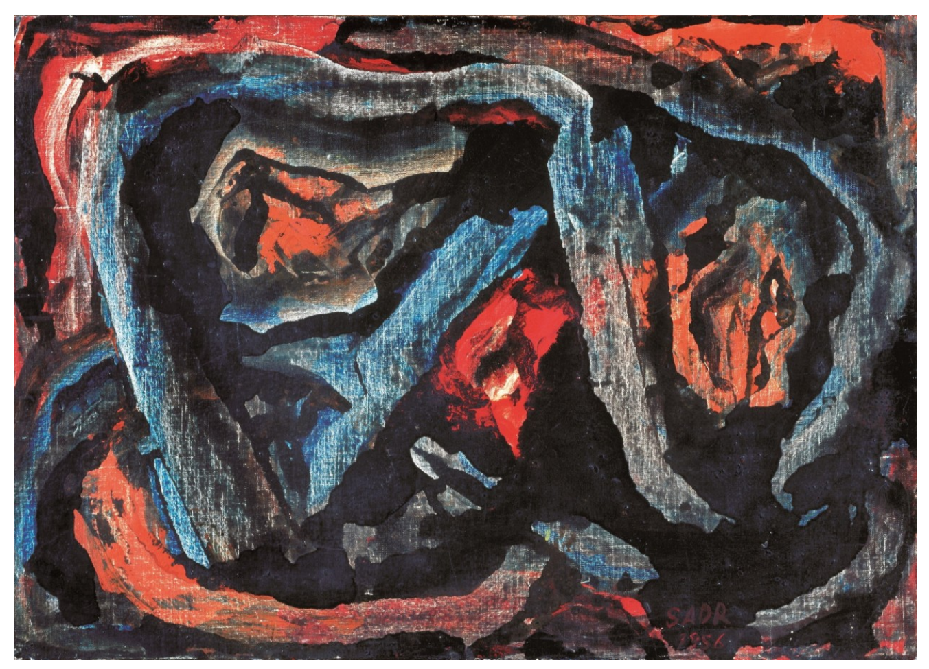
Behjat Sadr, 'Untitled' (1956) © Behjat Sadr Estate/DACS

Apparent throughout is a sense of the fragility, urgency and excitement during sociopolitical upheaval, in different global contexts. Barbarigo remembered an exhilaration wandering across deserted Venice in 1945: "I felt this openness and was nourished by it . . . seeing light on things, tones, grey details . . . ecstatic vagabonding."