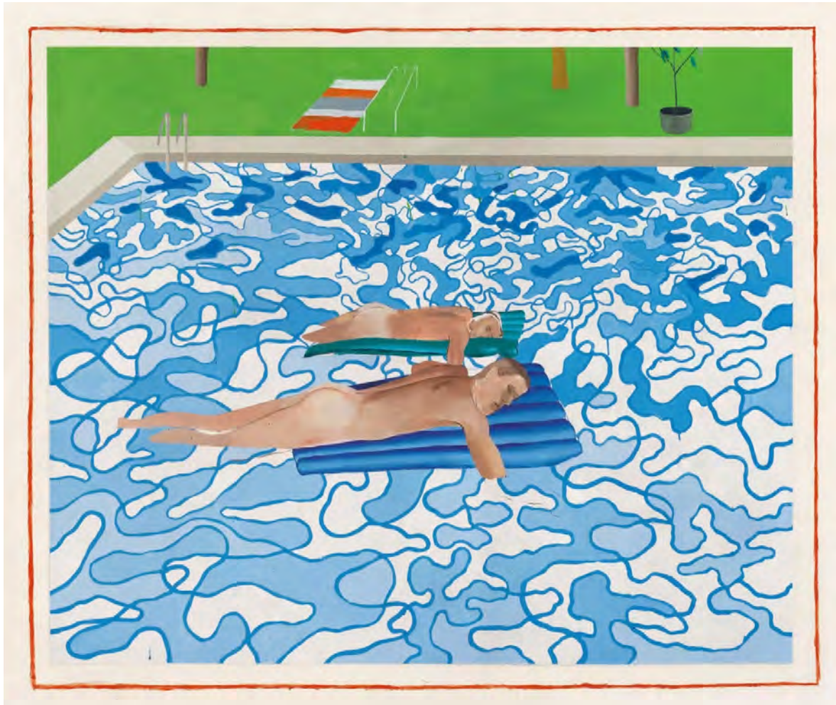
'California' (1965) by David Hockney, est £16mn

Sugimoto joins Lisson Gallery; compliments for Condo; Pace bolsters leadership in London; new time and place for Eye of the Collector