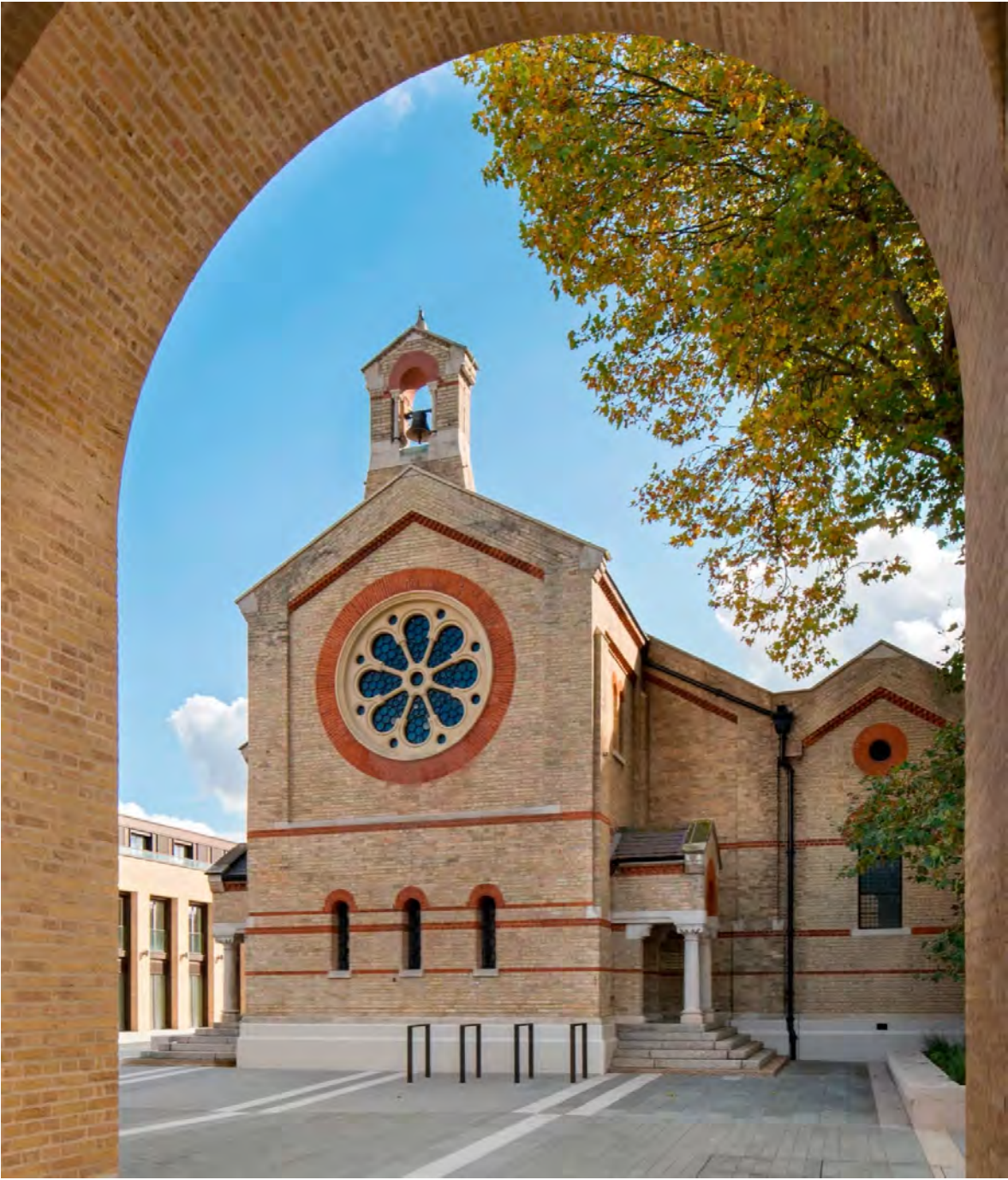
The Garrison Chapel, the new home for Eye of the Collector